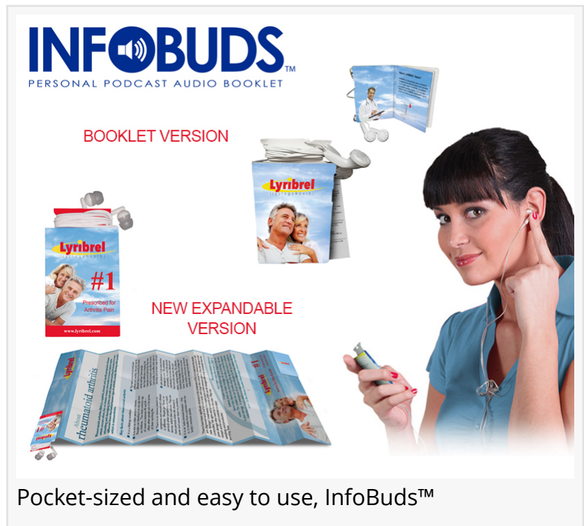
Pocket-sized and easy to use, InfoBuds™

Infobuds™ are particularly useful in the pharmaceutical, medical device and emerging medical endocannabinoid industry, where information and educational marketing & training products are of paramount importance. They are equally suitable for any business, brand or industry that wants their message to be seen and heard.