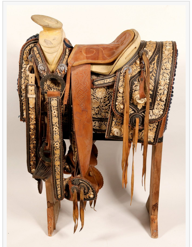
High-quality, ornate sterling silvered Mexican Charro parade-style saddle with matching sabre, sombrero and accoutrements, used in the Pasadena Rose Parade circa 1940 (est. $3,500-$6,000).