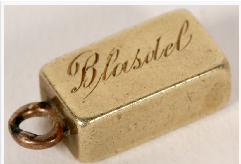
Gold silver Potosi Mine ingot from the Bill Bliss collection, 8 grams, engraved "Blasdel", used as a "charm" for Grace Blasdel, given to her on her wedding day in 1895 (est. $10,000-$20,000).

Day 1, on Friday, February 14th, will feature 74 lots of artwork, general Americana (to include jewelry, pocket watches, souvenir spoons, souvenir plates, ephemera (geographically sorted),