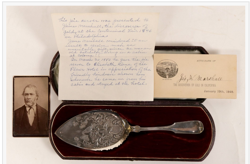
Silver pie server presented to California Gold Rush pioneer James Marshall at the Centennial Exhibition in Philadelphia, plus two cabinet card photos of Marshall (est. $5,000-$10,000).

Day 3, on Sunday, February 16th, will be a dream for fans of numismatics. There will be coins (encased and elongated, Masonic and general), medals and so-called dollars, ingots, currency,