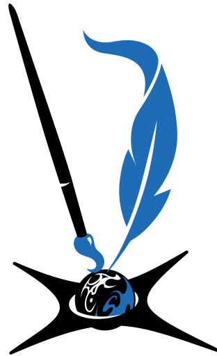
L. Ron Hubbard Presents Writers & Illustrators of the Future

This press release can be viewed online at: http://www.einpresswire.com