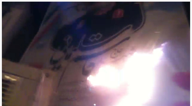
Tehran 2 - 29 Jan 2020