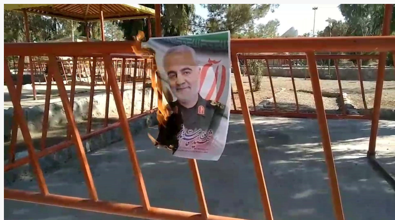
Isfahan - 29 Jan 2020

This press release can be viewed online at: http://www.einpresswire.com