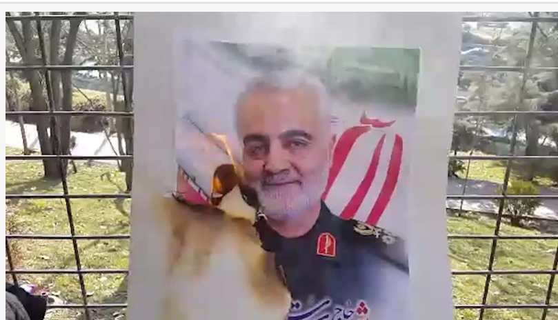
Tehran - 29 Jan 2020