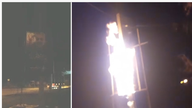
Borojerd - 29 Jan 2020