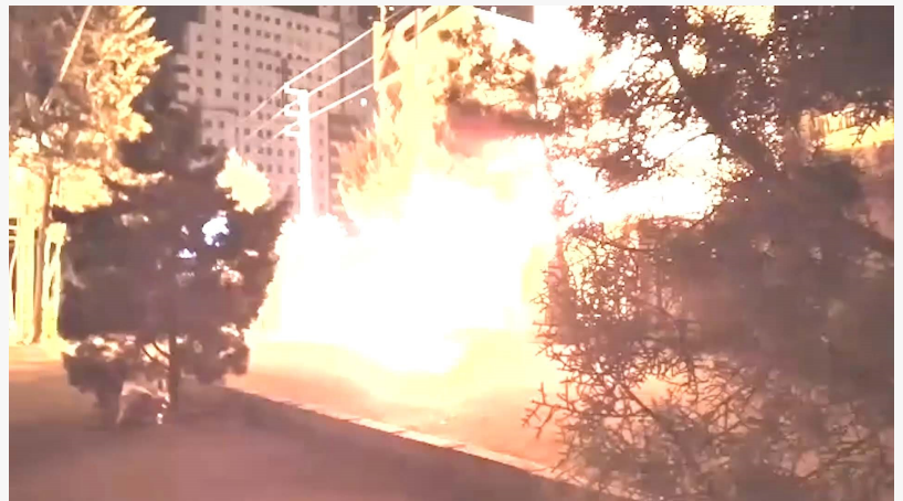
Tehran - Mohammad Ali Jannah Expressway - Torched HQ for the Execution of Khomeini's Order