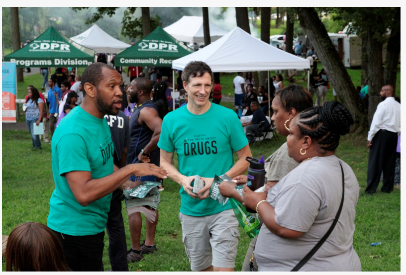
Educating people in a park using The Truth About Drugs Booklets