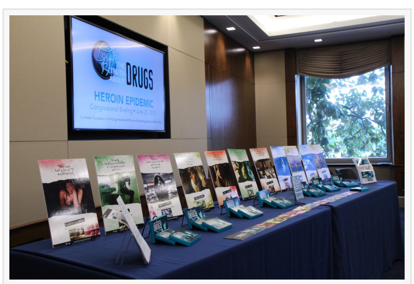
The Truth About Drugs Education Package contents are an effective weapon against ignorance of drug dangers

Written in plain language, easy to understand, and available in 22 languages, this information explains