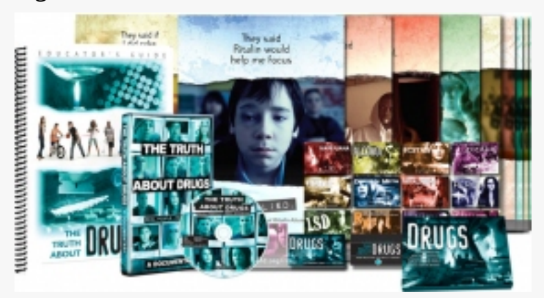
Drug-Free World provides these materials for free in 22 languages

among students here at the Division of Quirino. The materials shall be given to schools for