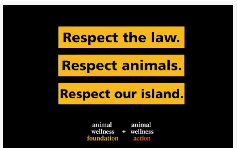
Animal Wellness Super Bowl Ad

A copy of the ad can be viewed by clicking here.