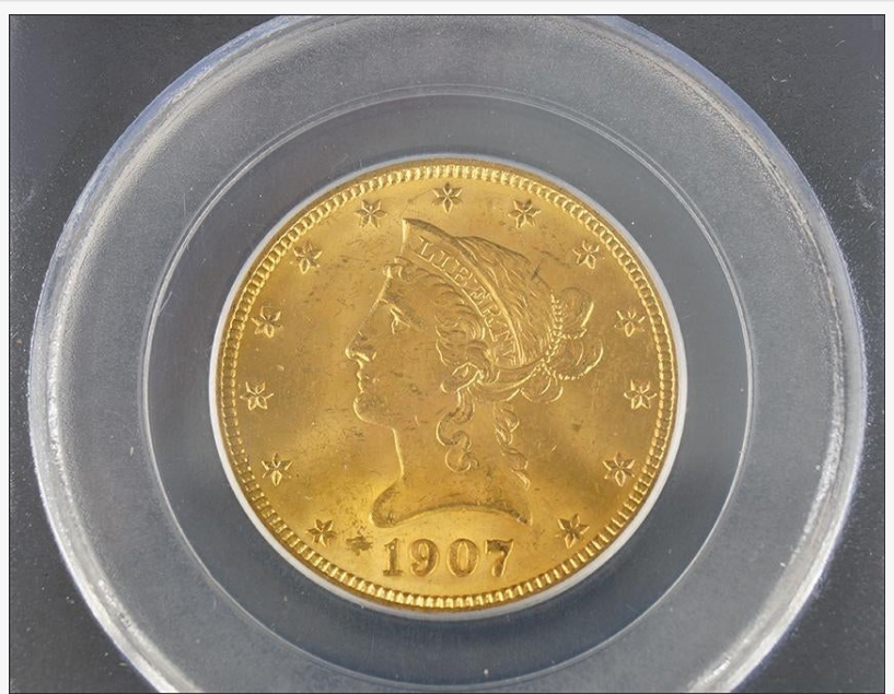
1907 $10 Liberty Head Eagle gold U.S. coin, graded PCGS MS62 (est. $800-$1,000).

Susanin's Auctioneers & Appraisers has been serving a global market of buyers and sellers since being established in 1993. After ten years in Chicago's Merchandise Mart, Susanin's relocated to