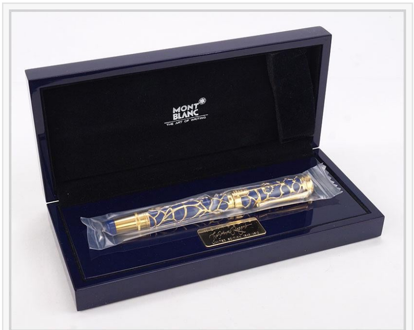
Montblanc Patron 4810: Prince Regent fountain pen – an homage to King George IV of Britain and the “Regency Period” of his era (est. $1,000-$1,200).

Rare and highly collectible fountain pens by many of the most recognizable names in the genre, such as Waterman , Aurora , Montblanc and others, will comprise the first 183 lots of the auction.