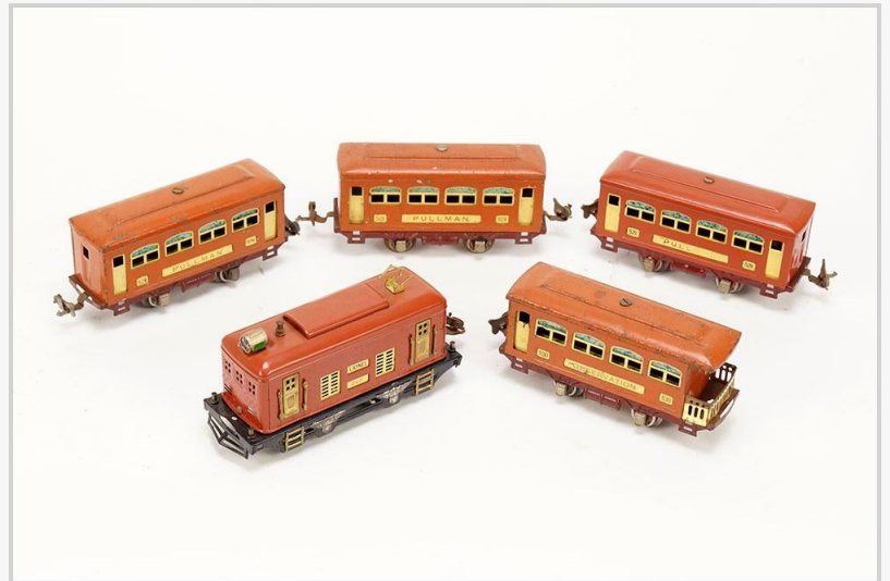
One lot consisting of a Lionel 248 electric locomotive, three Lionel 529 passenger cars and the Lionel 530 observation car, circa 1920s-1930s (est. $200-$400).

This press release can be viewed online at: http://www.einpresswire.com