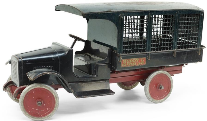
Buddy L Express Line toy truck, 13 inches long (est. $200-$400).