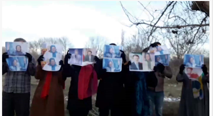
Shahroud - 2 Feb 2020

Shahin Gobadi NCRI +33 6 50 11 98 48 email us here Visit us on social media: Twitter