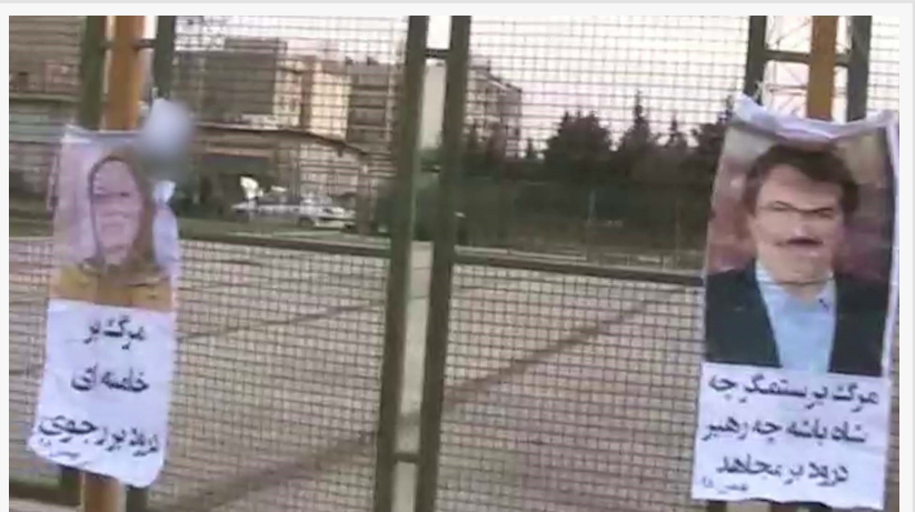
Iran 2 Feb 2020 - Tehran - Nazi-Abad