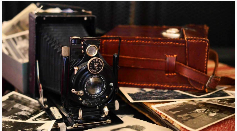
Dedicated Photo Safaris in Africa!

Wildlife photography requires patience, preparation, dedication and a guide that understands how to get you into the right position for that perfect capture. You also need lots of space and equipment to move in your vehicle. In short - you need to go on a dedicated photographic safari.