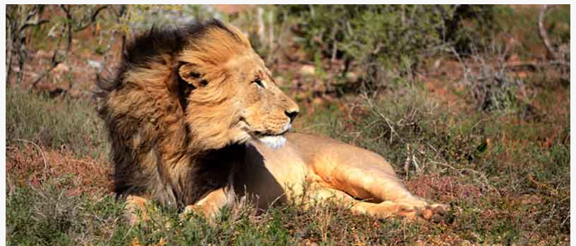
The African Lion - King of the Savannah!