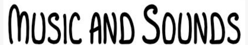
Karney Music and Sounds