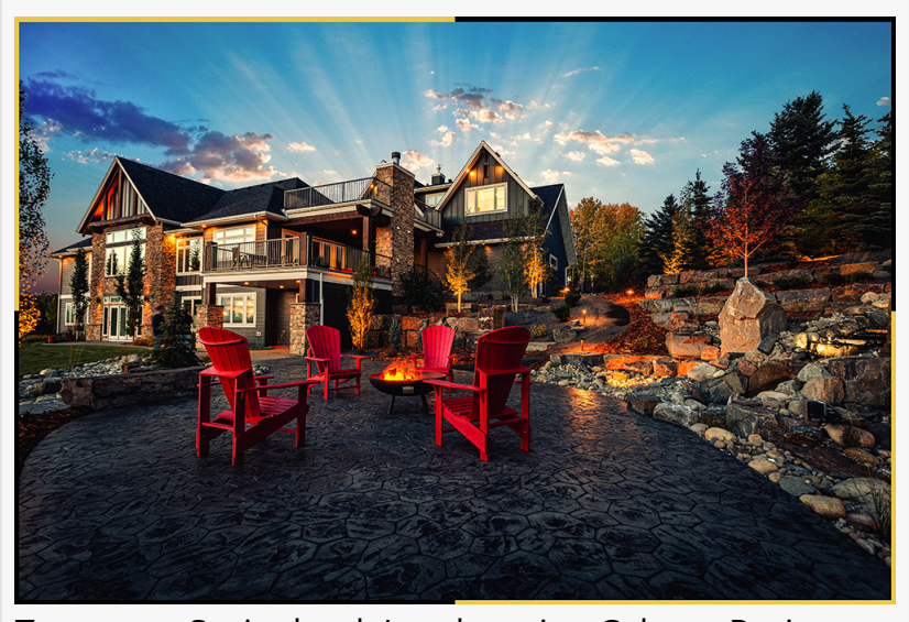
Tazscapes Springbank Landscaping Calgary Project -Night4-1