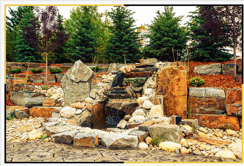
Tazscapes Springbank Landscaping Calgary Project - Day1 - 2

For more details, visit our website and check out our highly rated landscaping Calgary Reviews on Google (https://g.page/TazscapesInc?gm).