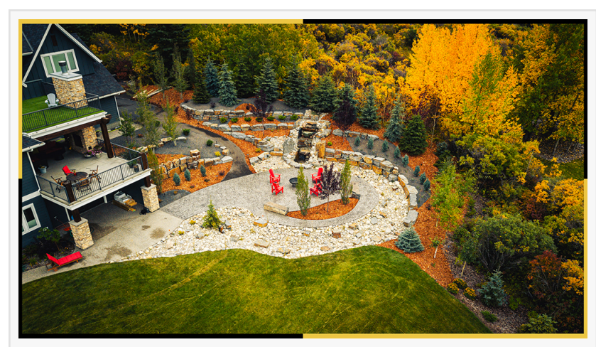
Tazscapes Springbank Landscaping Calgary Project - Day6-2

CALGARY, ALBERTA, CANADA, February 12, 2020 /EINPresswire.com/ -- We, Tazscapes Inc., the leading landscaping company in Calgary, are thrilled to announce that we're rated as the best landscaping company for 3 years in a row by ThreeBestRated.ca. There's a Swedish proverb: "Shared joy is a double joy..." So, we wish to share our success story with you all that we've completed our most significant project 'Springbank Landscaping' up to date.