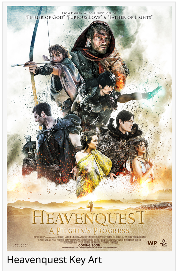
Heavenquest Key Art

"Heavenquest has a strong Christian, biblical worldview...the powerful allegory makes the movie