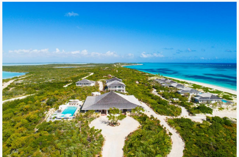
Sailrock in South Caicos

The two-bedroom Oceanfront Reef Villa, located 1.2 miles away from the resort, is positioned directly on an elevated oceanfront site in the Sailrock Peninsula neighborhood with spanning