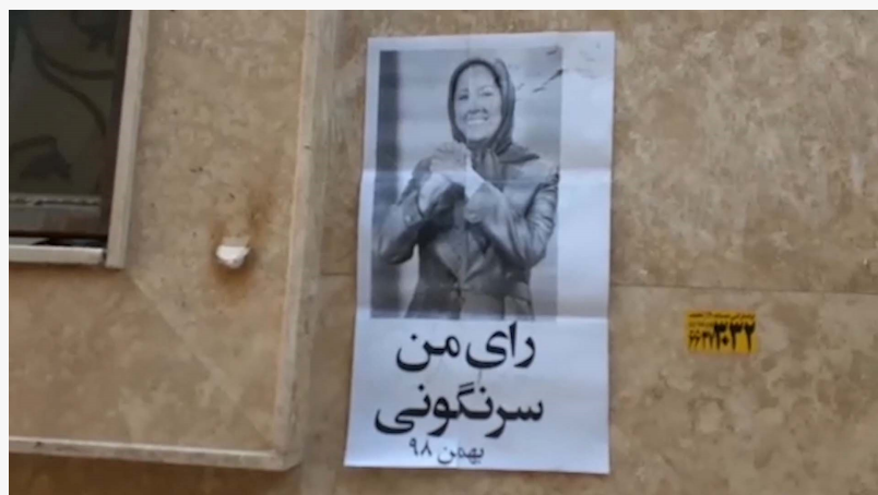
Tehran 5 Feb 2020 - Maryam Rajavi

This press release can be viewed online at: http://www.einpresswire.com