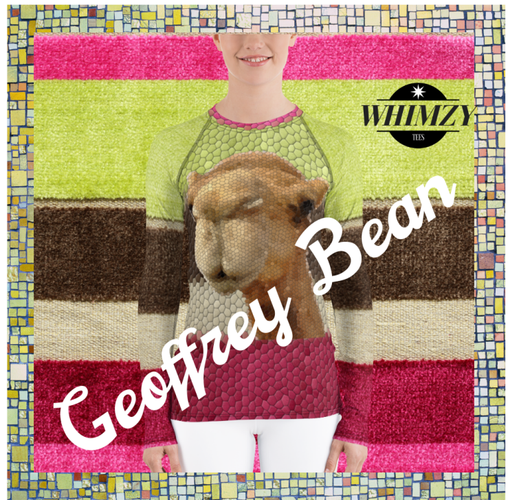
Geoffrey Bean Rashguard