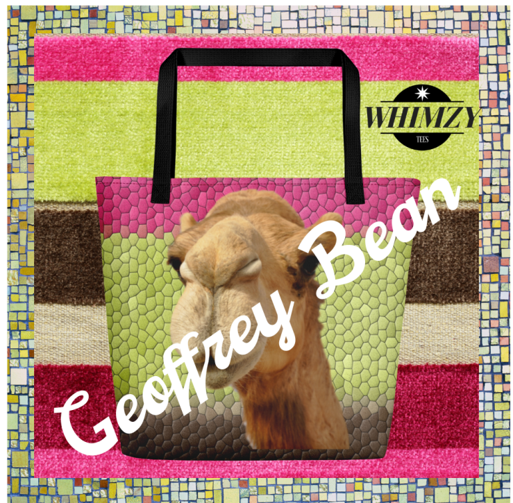
Geoffrey Bean Beach Tote

This press release can be viewed online at: http://www.einpresswire.com