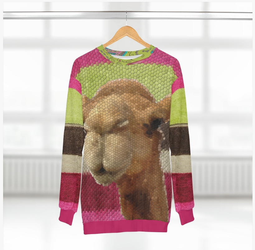
Geoffrey Dromadaire Sweatshirt