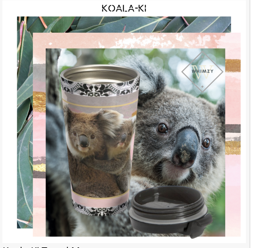
Koala-Ki Travel Mug

This press release can be viewed online at: http://www.einpresswire.com Disclaimer: If you have any questions regarding information in this press release please contact