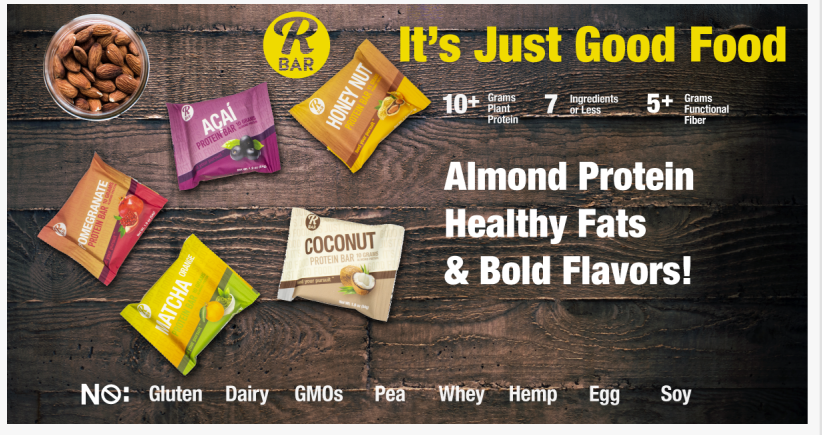
RBar Protein Bars are Available in 5 Bold Flavors with 10g of Almond Protein

TUCSON, AZ, UNITED STATES, February 6, 2020 /EINPresswire.com/ -- Whether you're an athlete, a parent, a weekend warrior, or a hero, we created RBar to help feed your pursuits. Known for its plant-based energy bar product line, RBar is launching a new collection of plant-based protein bars in early February 2020 online and through Indiegogo. The new protein bars are driving innovation in the health food