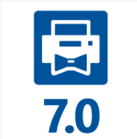
Print Conductor 7.0 Logo

This press release can be viewed online at: http://www.einpresswire.com