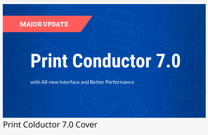
Print Conductor 7.0 Cover

RIGA, LATVIA, February 6, 2020 /EINPresswire.com/ -- Batch printing software Print Conductor was recently updated to version 7.0. The program has got a range of improvements, including renewed interface, smart processing core, more convenient settings controls, and new capabilities.