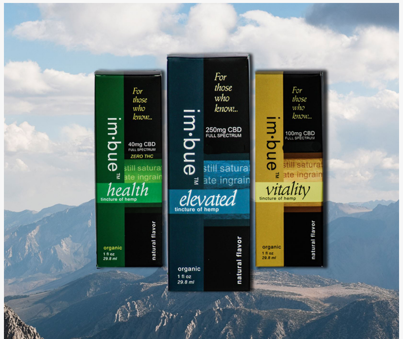
Colorado Grown CBD

Approved CBD Vendor - American Pharmacies