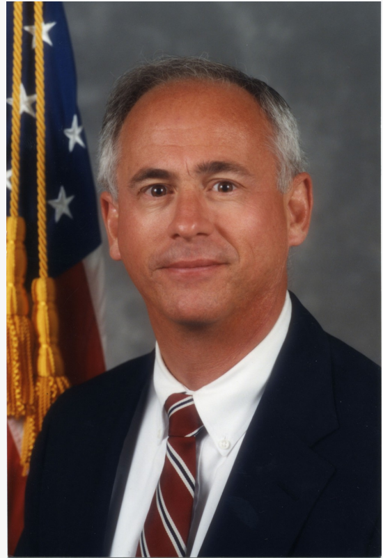
Co-Author, Former FBI Asst. Dep. Director