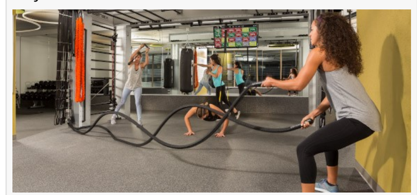
Growing Profits In Clubs With Precor

This press release can be viewed online at: http://www.einpresswire.com