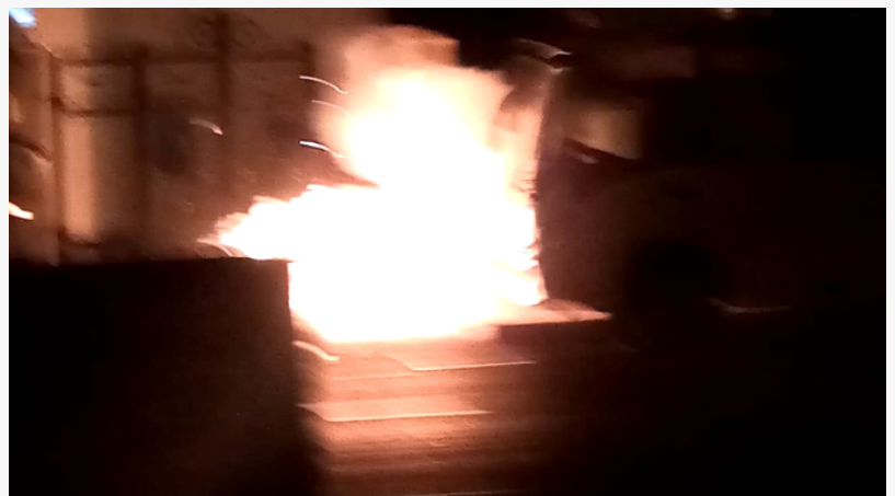
Iran: Revolutionary Prosecutor's Office in Tehran's 10th District torched