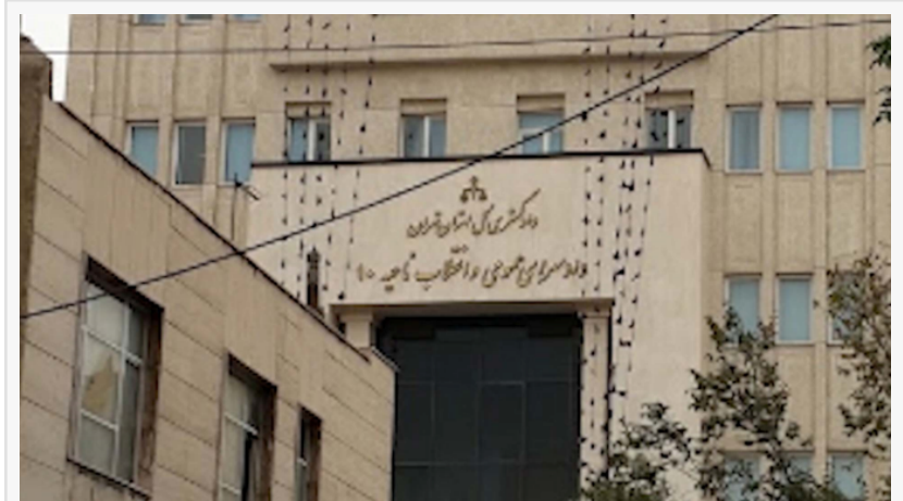
The Revolutionary and General Prosecutor's Office in the Tehran's 10th District torched

The Revolutionary and General Prosecutor's Office in the capital's 10th District has played an active role in suppressing and issuing execution and lengthy prison sentences for dissidents, especially those arrested during the November 2019 nationwide uprising.