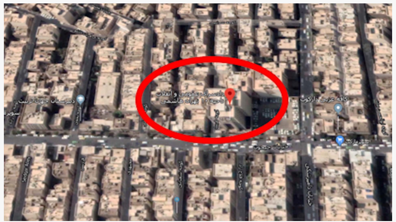
Iran: Revolutionary Prosecutor's Office in Tehran's 10th District targeted