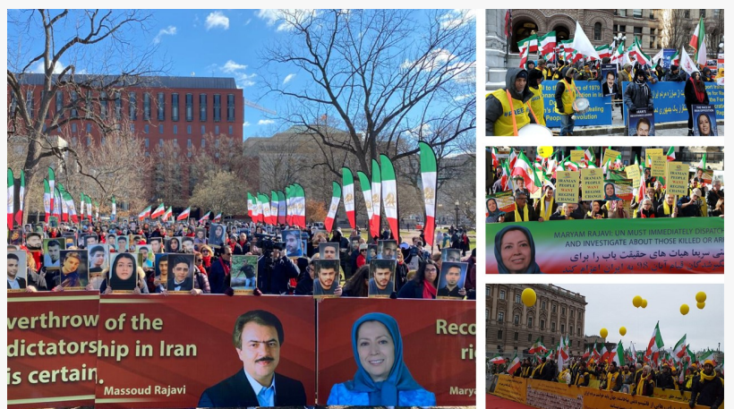
Iranians in and out of Iran hold campaigns for freedom simultaneous with the anti-monarchic revolution anniversary Rallies in Washington DC, London, Rome, Toronto, Stockholm, Geneva, and Brussels

Inside Iran, Resistance Units posted messages and pictures of Mrs. Maryam Rajavi, the President-elect of the National Council of Resistance of Iran (NCRI), and Mr. Massoud Rajavi, the Leader of the Iranian Resistance, in different parts of Tehran, including in Jalal Al-Ahmad Expressway, Parkway, and Damavand, as well as in the cities of Shiraz, Tabriz, Rasht, Mashhad, Ahvaz, Gachsaran, and Karaj.