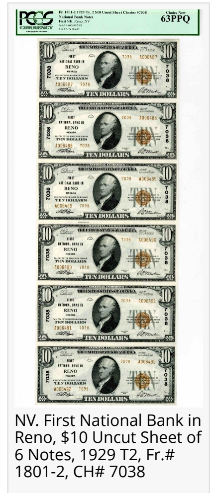
NV. First National Bank in Reno, $10 Uncut Sheet of 6 Notes, 1929 T2, Fr.# 1801-2, CH# 7038

Session 2 features 360 lots of U.S. & World Scripophily. Some of the many highlights include a Specimen PIXAR stock certificate with a facsimile signature of Steve Jobs; foreign scripophily featuring bonds and shares from Chile, France, Mexico, Panama and other countries. Additional