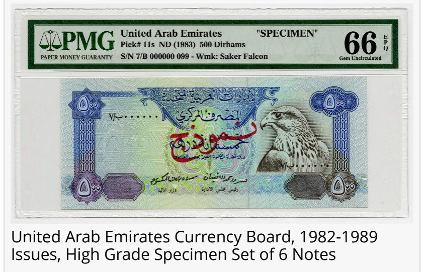
United Arab Emirates Currency Board, 1982-1989 Issues, High Grade Specimen Set of 6 Notes