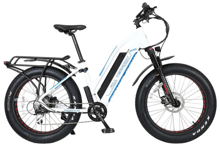
The All Terrain R750 ST is a step thru design that allows for easy access for riders of all heights.