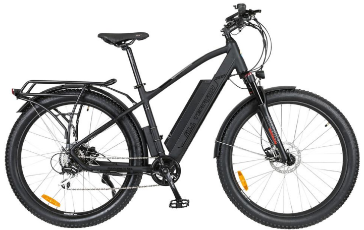
The All Terrain R750 Sport is a road optimized electric bike designed for both commuting and adventure

At the helm of the improved All Terrain series is a new color display that offers riders full control of the pedal assist support with nine levels of assist, while also showcasing key stats such as speed, ride distance, remaining battery and motor watt output. The bikes are able to be used with pedal assist only, with no motor assistance or in the optional throttle only mode that allows