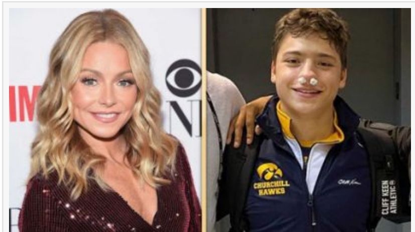
Kelly Ripa (left) and Joaquin Consuelos with broken nose (right)