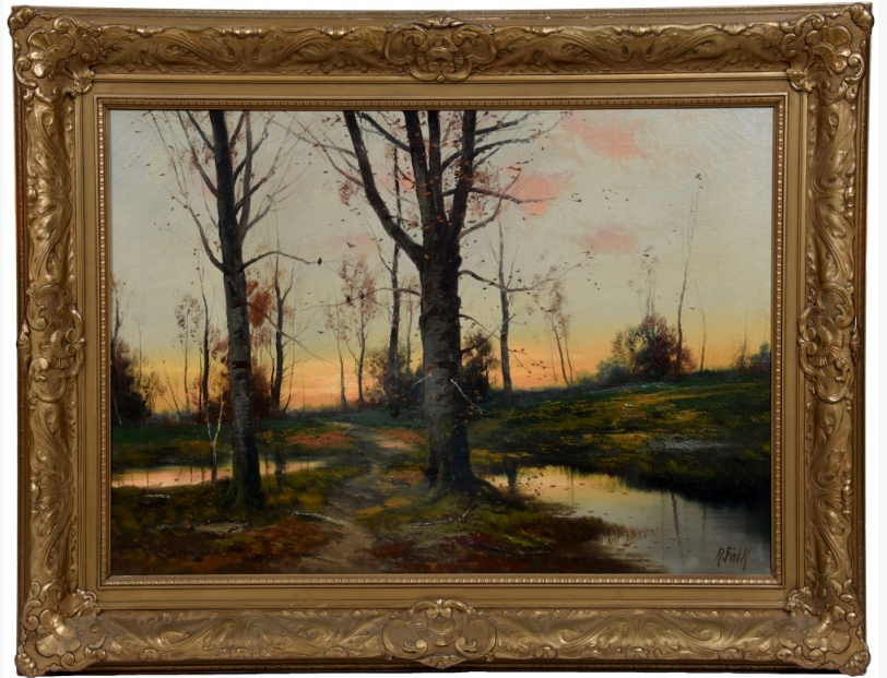
Oil on canvas painting by the Russian artist Robert Rafailovich Falk (1886-1958) depicting a classic scene of a pathway through trees along a stream, mounted in the original gilt wooden frame.

This press release can be viewed online at: http://www.einpresswire.com