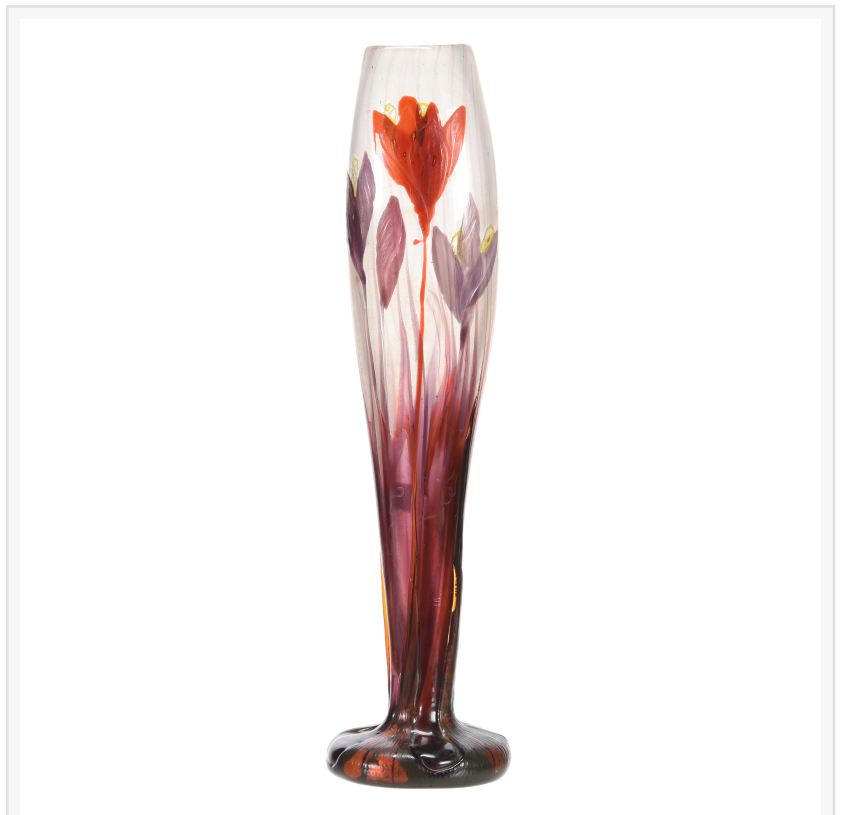
Galle marquetry vase, circa 1900 vase, the finest Woody Auction has ever offered, 17 ¾ inches tall, magnificent in form, boasting a multiple carved crocus design and exquisite color and quality.

Fans of Wave Crest will be drawn to a wall plaque showing a scene of a woman surrounded by flowers with a cobalt blue border, the original backing and mounted to an elaborate 16 ½ inch by