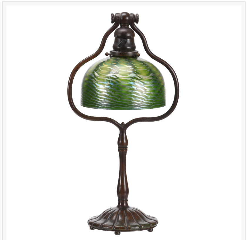
Tiffany Studios harp desk lamp, 18 inches tall, featuring a 7-inch diameter green iridescent dome shade with a silver threaded design. The lamp is signed "L.C.T." and the base is marked "Tiffany Studios".

Jason Woody Woody Auction +1 316-747-2694 email us here