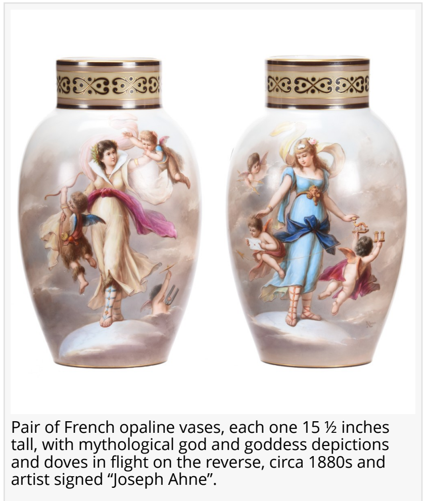
Pair of French opaline vases, each one 15 ½ inches tall, with mythological god and goddess depictions and doves in flight on the reverse, circa 1880s and artist signed "Joseph Ahne".