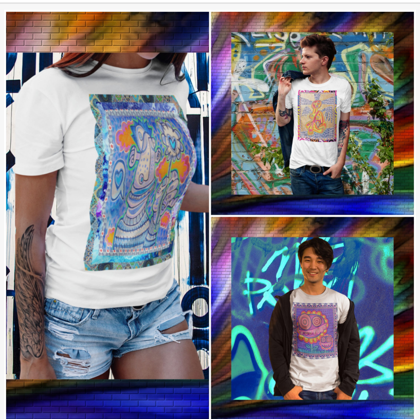
Mr Hyde Tees

should not only be practical but fun as evidenced by their Dog Dayz, Carnivale, and Cat-e-chism lines. It's textile/applied arts on steroids that appeals to a particular niche market who appreciates art, bold colors, and unique patterning not found elsewhere. And, their new collaboration with Mr Hyde is further testament to their eye to the unusual...the unique...the