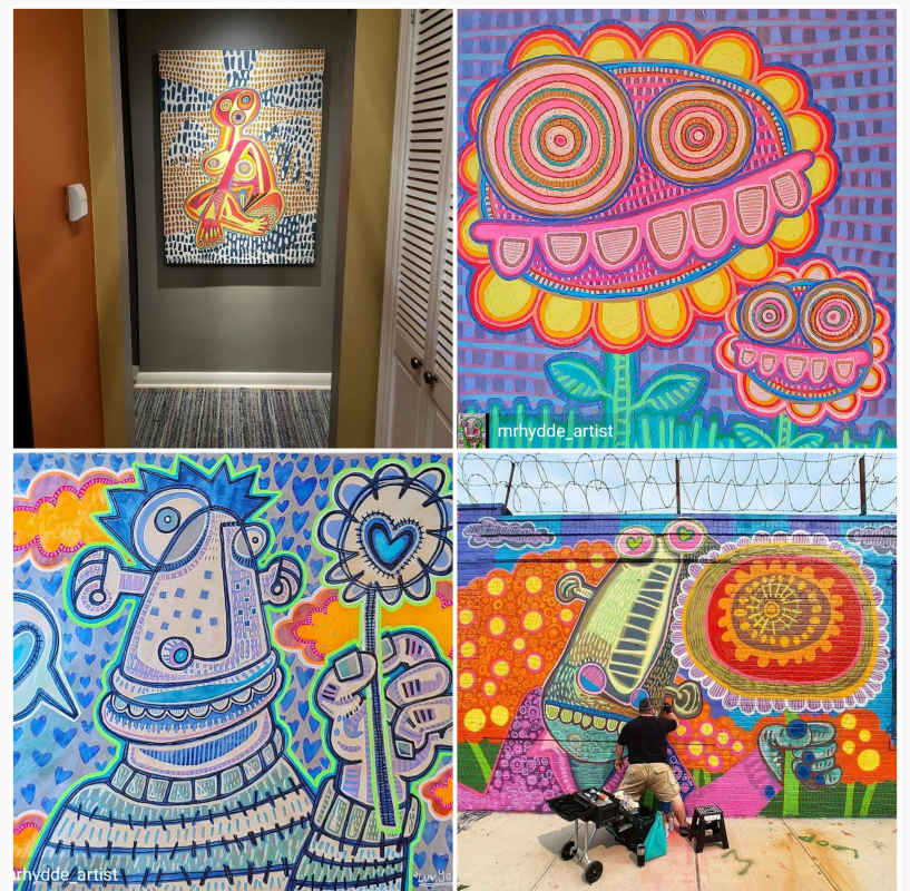
Mr Hyde Collage