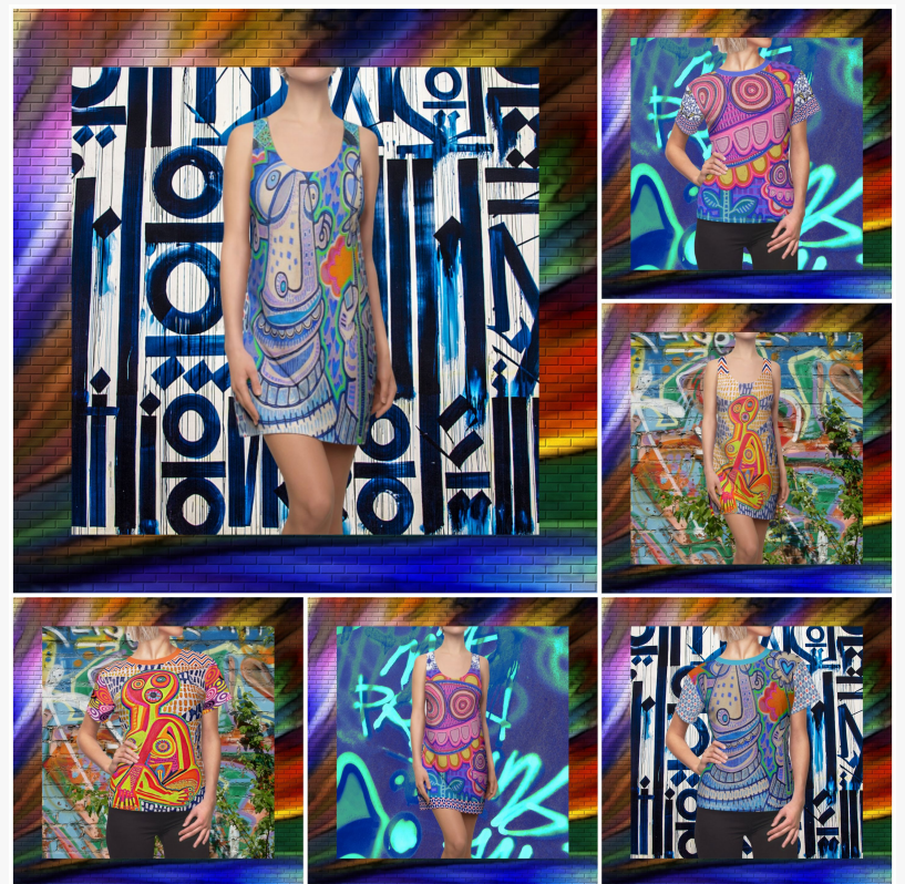
Mr Hyde Select Items