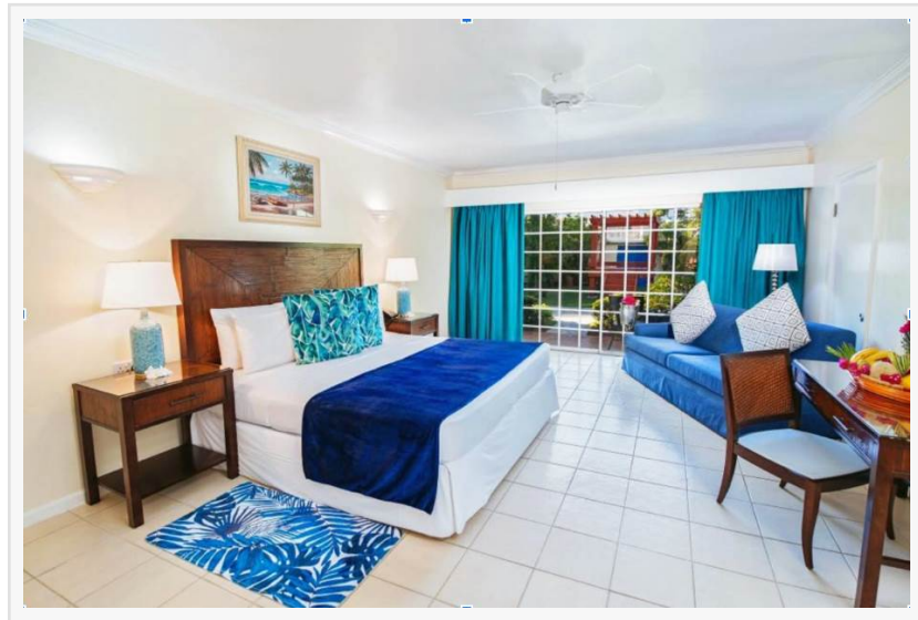
A newly renovated Junior Executive Suite with King bed with Caribbean blue accents

Environmentally friendly soap dispensers have replaced single-use plastic bottles at the group of hotels, which recently took top Environmental Stewardship honors at the 2019 St. Lucia Business Awards. Bay Gardens Hotel, Bay Gardens Inn and Bay Gardens Beach Resort & Spa each