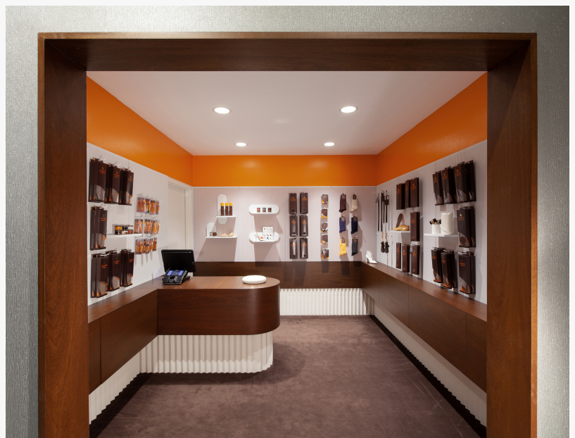
Leather SPA Saks Fifth Avenue New York