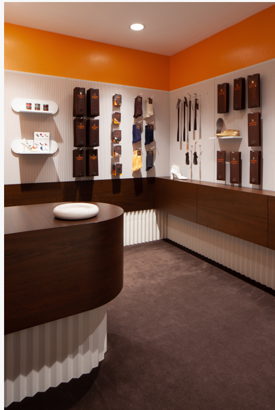
Leather SPA Saks Fifth Avenue New York