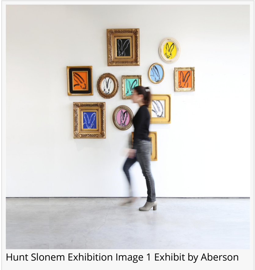
Hunt Slonem Exhibition Image 1 Exhibit by Aberson

Slonem's works can be found in the permanent collections of 250 museums around the world, including the Solomon R. Guggenheim Museum, the Metropolitan Museum of Art in New York City, the Whitney, the Miro Foundation and the New Orleans Museum of Art.