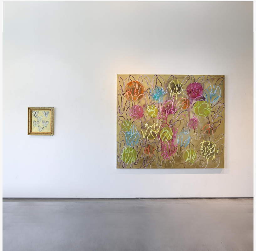
Hunt Slonem Exhibition Image 3 at Exhibit by Aberson 2020