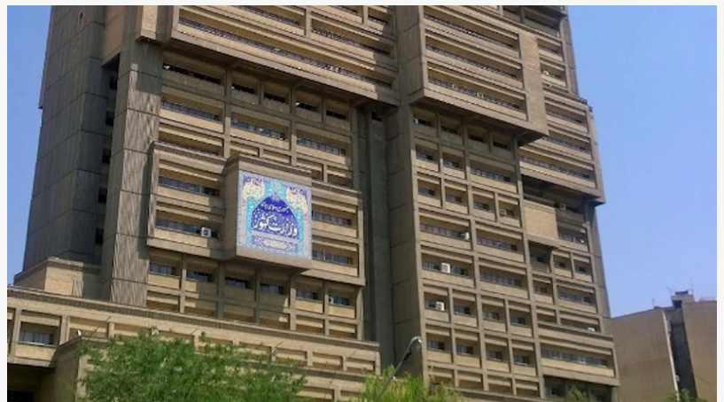
Interior Ministry Building in Tehran