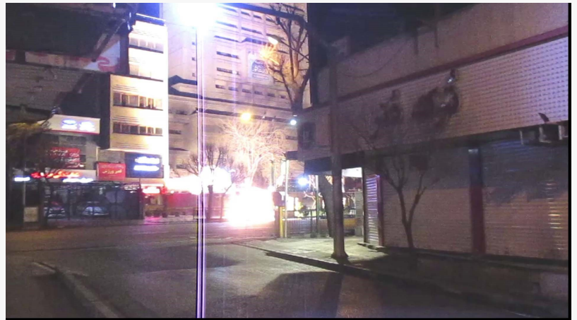
Interior Ministry Building in Tehran