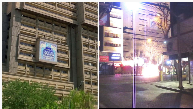
Interior Ministry Building in Tehran

This press release can be viewed online at: http://www.einpresswire.com