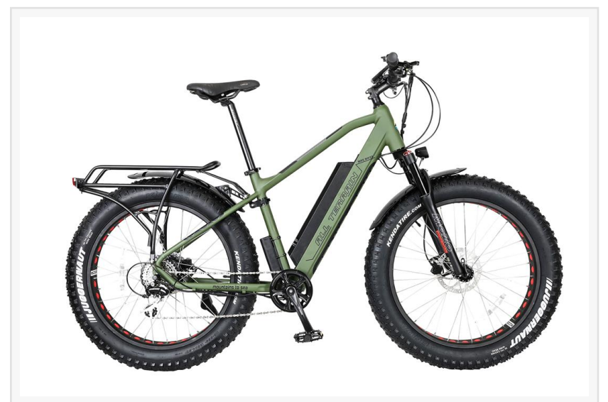
The new and improved All Terrain R750 is off to a fast start with a recently launched Kickstarter campaign

M2S Bikes opted to pursue the crowd funding model as a way to gauge popularity of their new model styles and colors. This year they are offering both a standard frame and step thru frame in two different tire choices with multiple battery options and color choices. In the past year the rapidly growing North Carolina-based electric bike brand sold and delivered over 2400 bikes to customers across the United States. Based on the fast start