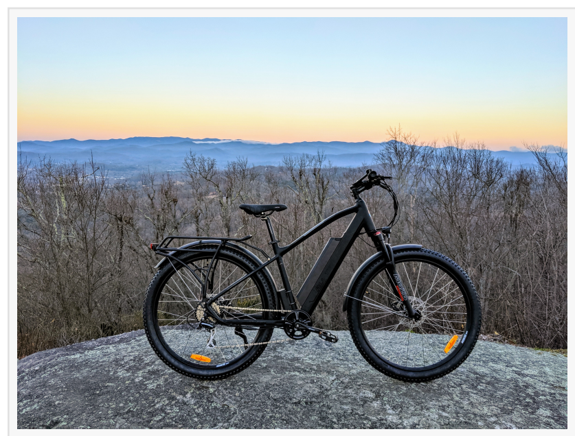
The new All Terrain Sport 29+ design is proving to be a popular option with the pre-order campaign

By offering both a fat tire version and a more traditional mountain bike style tire option, M2S Bikes is widening the