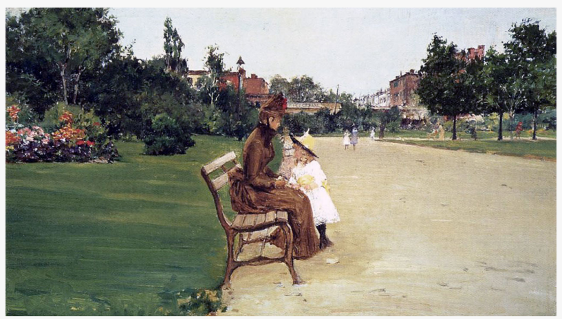
Top Local Real Estate Agent Grapevine TX

Why use a top realtor to market your property? A home is typically the biggest financial investment that a person makes in a life time. When it comes time for you to market your house the bottom line is this. Am I getting the most effective profit for my residence? https://real-estate-agents-realtors-grapevine-texas.business.site/