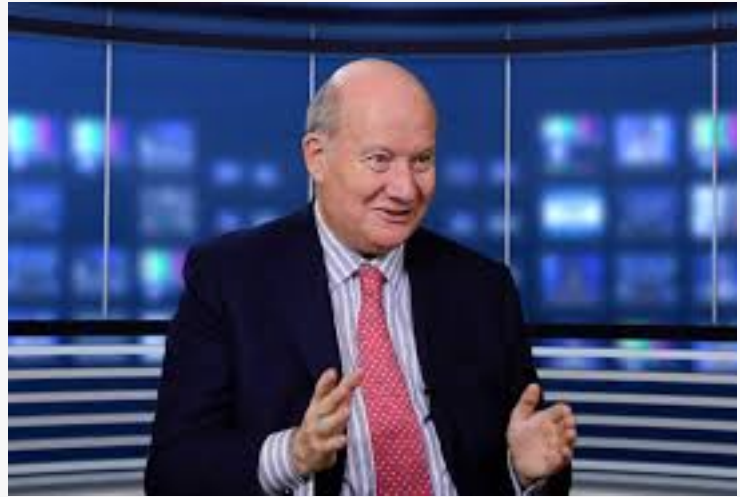
Author, Massimo Introvigne

Prayer is powerful. Standing shoulder to shoulder in action is mandatory. People of all faiths must stand together against persecution of any faith.