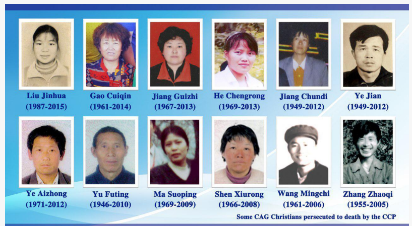
Some of the Church of Almighty God members persecuted to death in China.