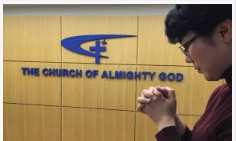
The Church of Almighty God persecuted in mainland China.

Sue Taylor National Affairs Office +1 202-667-6404 email us here