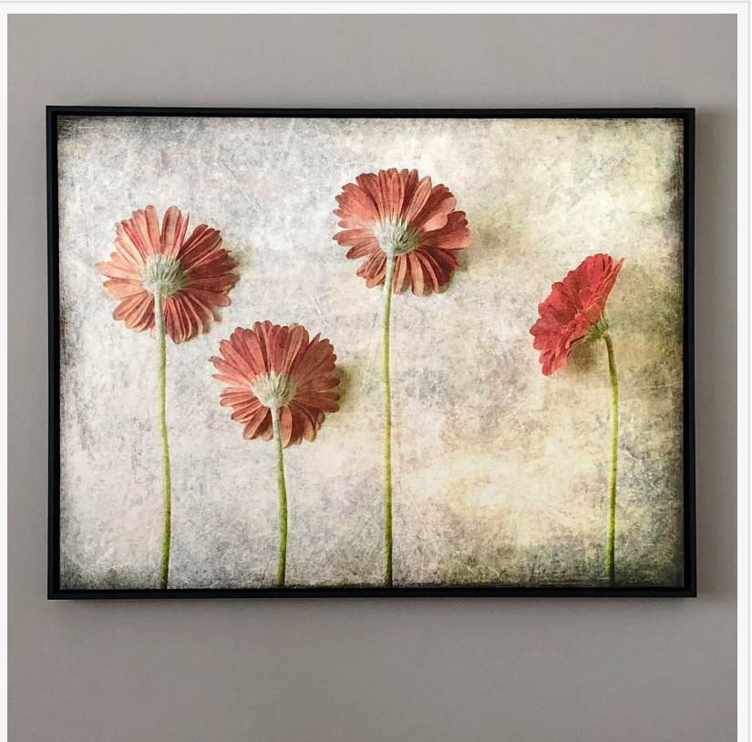
Daisies