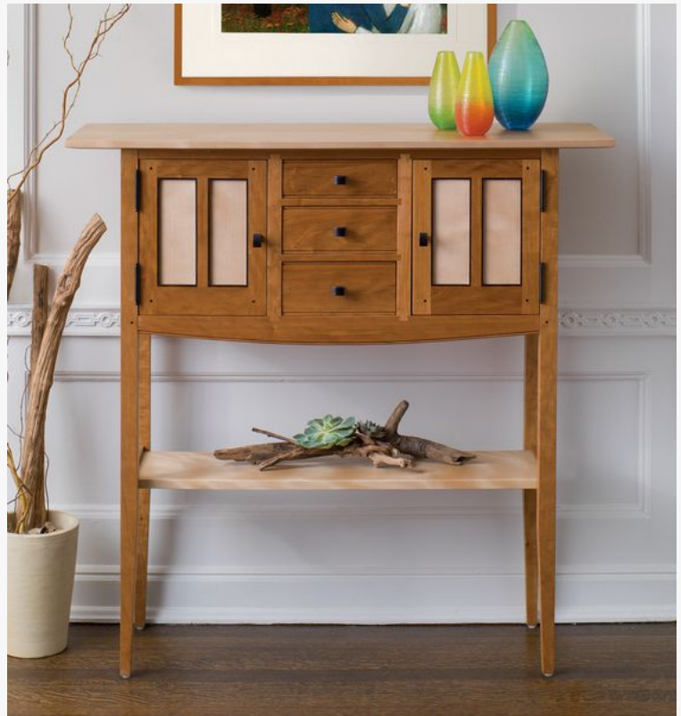
Foyer Sideboard, Furniture, Tom Dumke

This press release can be viewed online at: http://www.einpresswire.com