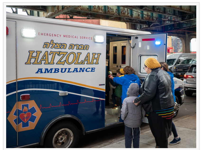
Hatzolah Visits Students at Shema Kolainu - Hear our Voices