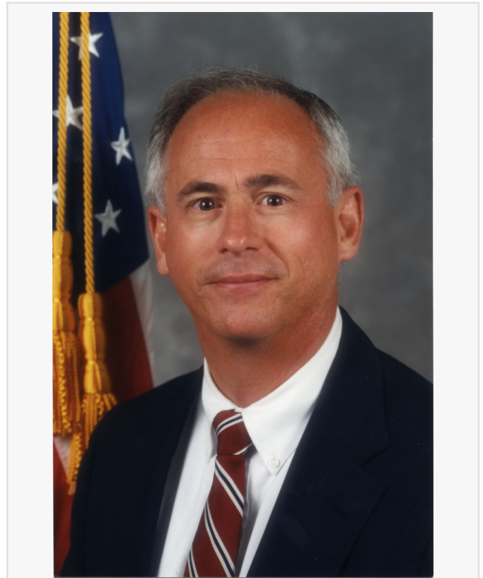
Co-Author, Former FBI Asst. Dep. Director