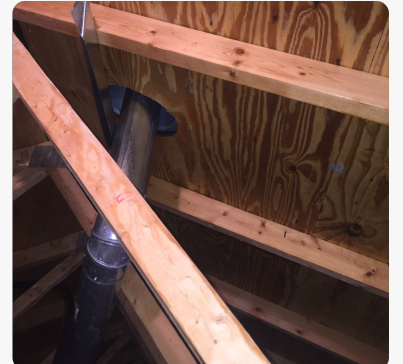
Attic Mold Before & After