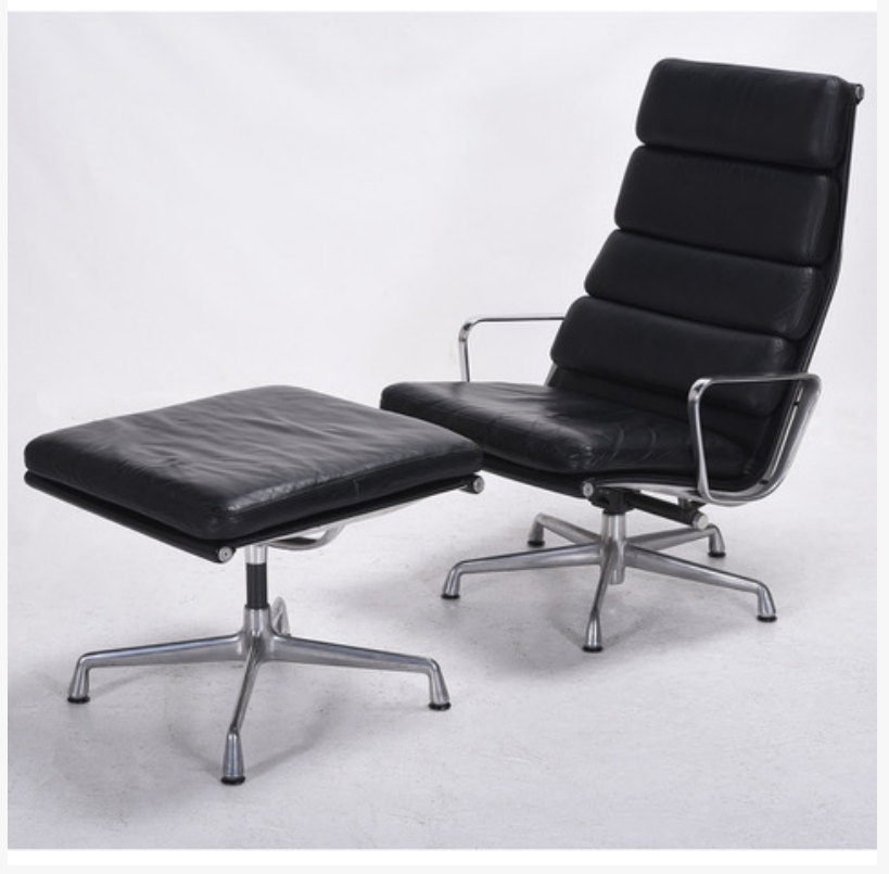
Black Chair and Foot Rest

Asian art treasures are always in high demand at Michaan's. The March 7 Gallery Auction features Asian art from a private collection of exceptional diversity and quality, amassed by a prominent local antiquarian and designer over many decades. The consignor is a celebrated San