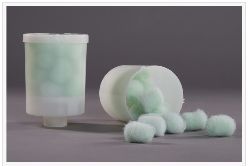
EGo3 hot tub filter multiuse cartridge with hot tub filter material