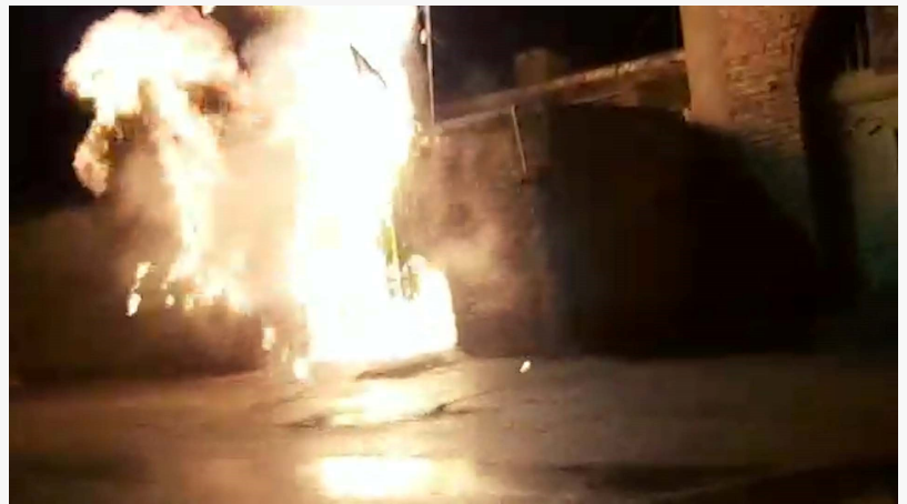
26 Feb 2020 - Paramilitary Bassij Base – Foulad-Shahr - Isfahan targeted

This press release can be viewed online at: http://www.einpresswire.com