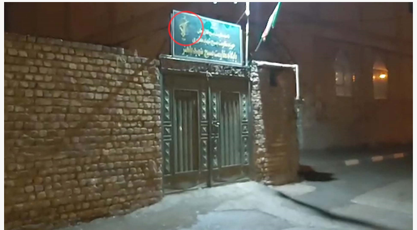
26 Feb 2020 - Paramilitary Bassij Base – Foulad-Shahr - Isfahan targeted

Secretariat of the National Council of Resistance of Iran February 27, 2020