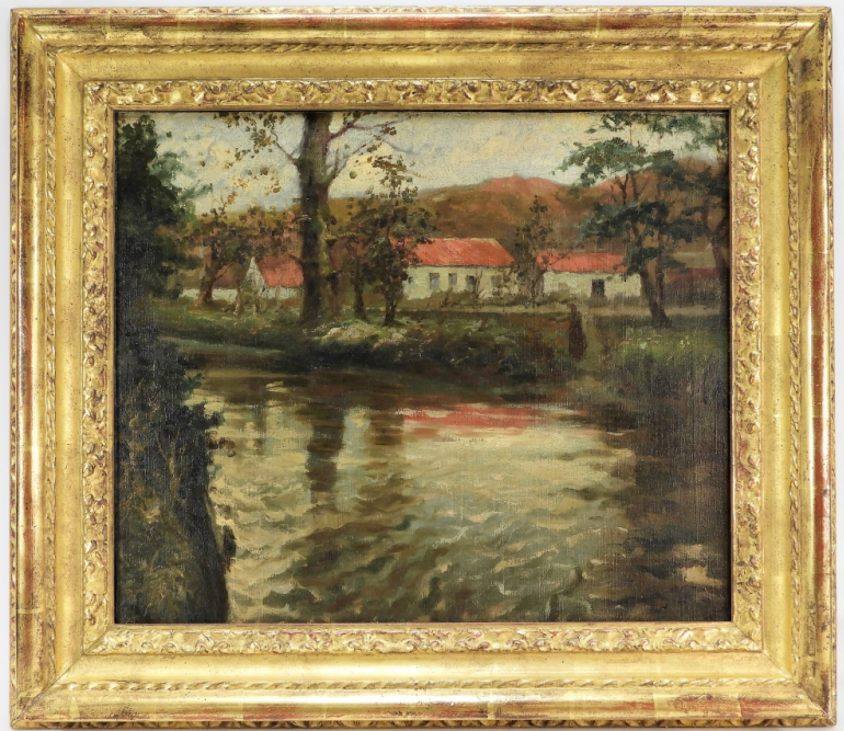
Impressionist oil on canvas painting by Norwegian artist Frits Thaulow (1847-1906), depicting a young woman by the edge of a river with her home in Norway behind (est. $15,000-$25,000).