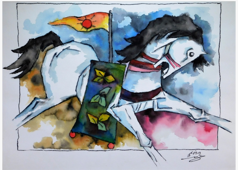
Watercolor painting by Maqbool Fida Hussain of a leaping white horse with open mouth draped with a green saddle blanket and carrying a flag with the image of a sun (est. $8,000-$12,000).