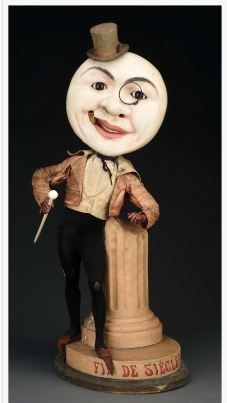
Gustav Vichy (French) 'End of the Century Moon' musical automaton depicting smartly dressed Man in the Moon with papier-mache head. Ref. Pg. 68, 'Automata – The Golden Age' by Christian Bailly. Estimate $30,000-$60,000

The spotlight will also be shining on the European doll and automata section, starting with an extraordinary 17½-inch Bru bebe with extra clothes, many lovely accessories and an antique round-top trunk. The lot is estimated at $10,000-$12,000. The premier selection of automata includes creations by French makers Leopold Lambert, Gustav Vichy and Jean Roullet, and an unidentified, possibly German-made organ grinder marked 1885 Philadelphia. Two of the sale's highest-estimated lots are a Roullet "Snake Charmer" automaton depicting an exotic dancer with