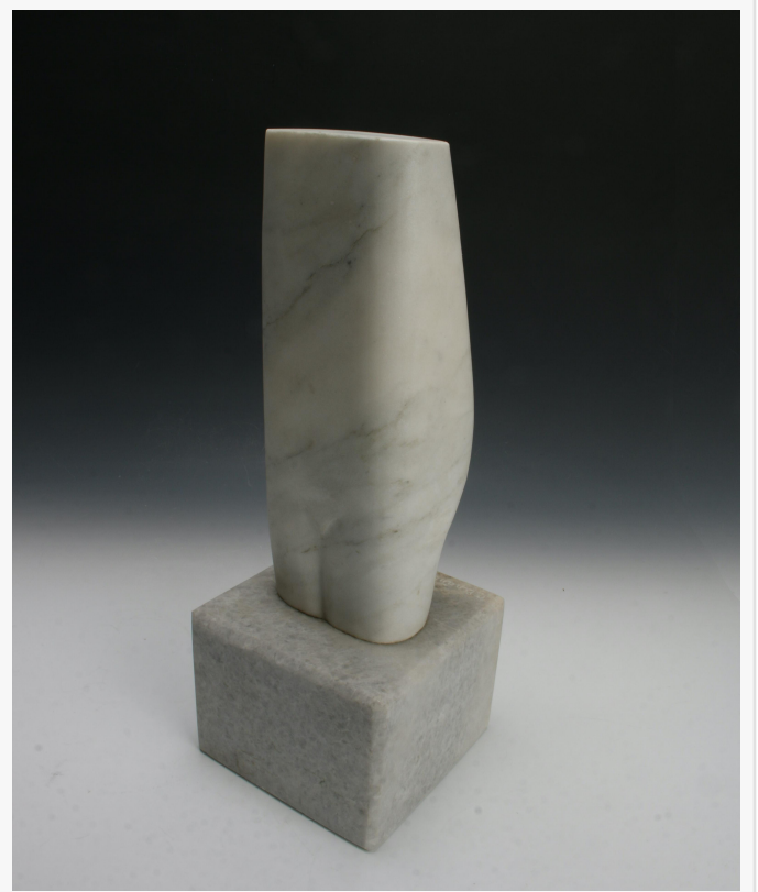
Lovely carved marble torso of a female, done in a style consistent with Constantin Brancusi's. Unauthenticated, signed on the plinth "C. Brancusi 1943" (est. $2,000-$4,000).