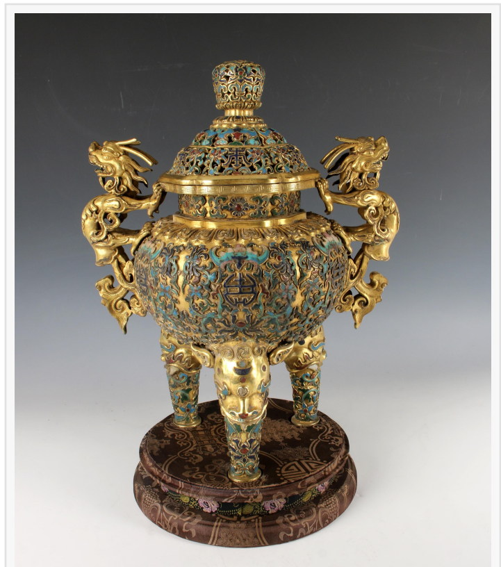
Elaborately decorated gilt bronze lidded censer with beast handles, 16 ½ inches tall, with colorful accent characters, bats, flowers and tendrils on the body and lid (est. $8,000-$12,000).

The elaborately decorated gilt bronze lidded censer with beast handles, 16 ½ inches tall, has an estimate of $8,000-$12,000. It has colorful accent characters, bats, flowers and tendrils on the body and lid, plus a presentation box. The two zitan folding chairs boast heavily carved legs, arm rests and back, all in a dragon and cloud motif. The backsplat has a dragon carved into it and the back of the chair is carved in a ruyi with flaming pearl. The pair should finish at $3,000-$5,000.