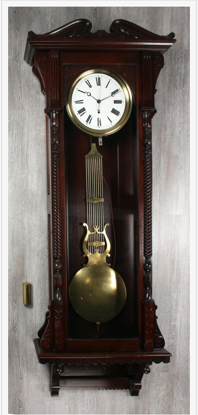
William Gilbert Jewelers wall regulator, 80 inches tall, having a pinwheel time only escapement with grid iron pendulum (est. $5,000-$8,000).

This press release can be viewed online at: http://www.einpresswire.com