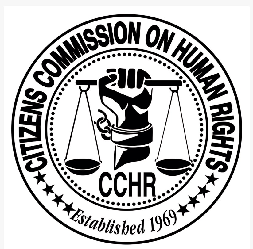
The Citizens Commission on Human Rights is a nonprofit mental health watchdog dedicated to the eradication of abuses committed under the guise of mental health.

March 1969. For more information please visit <u>www.cchrflorida.org</u>.