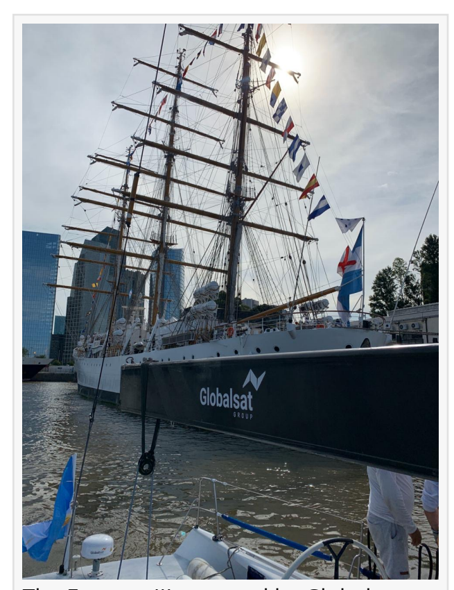
The Fortuna III powered by Globalsat Group

The requirements of this highly technical sport demand competent and reliable information and telecommunication systems. Having an IP-based satellite terminal allows the crew to access meteorological applications, nautical charts, send images, videos and in general be in permanent communication for mission success and safety.