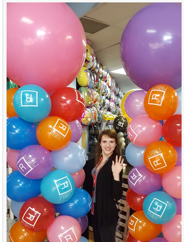
Giant balloons look great at the top of a custom balloon column

For years now, CSA Balloons has offered new seasonal promotions to its client roster. This newest promotion is expected to lure businesses into ordering large numbers of custom balloons. The Canadian printer is counting on the increasing popularity of Giant 36-inch balloons to support this new campaign. It will be interesting to see the effect this promotion will have on the balloon displays that will be coming up shortly!