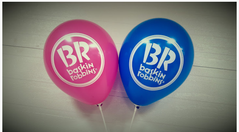
Example of a same logo printed on two balloon colors. Change is at no extra cost.

This press release can be viewed online at: http://www.einpresswire.com