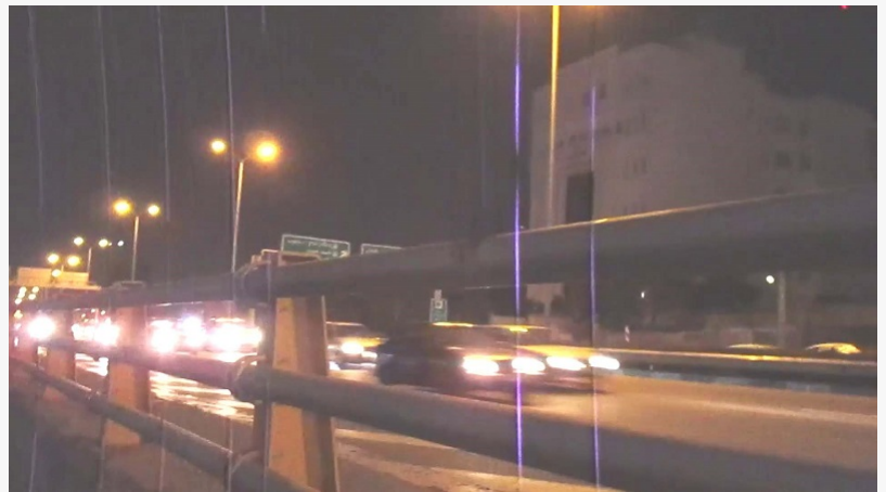
Revolutionary Prosecutor's Office in Tehran's 2nd District-3