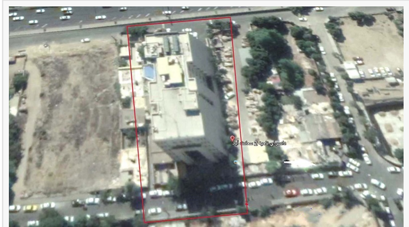
Revolutionary Prosecutor's Office in Tehran's 2nd District

Secretariat of the National Council of Resistance of Iran March 8, 2020