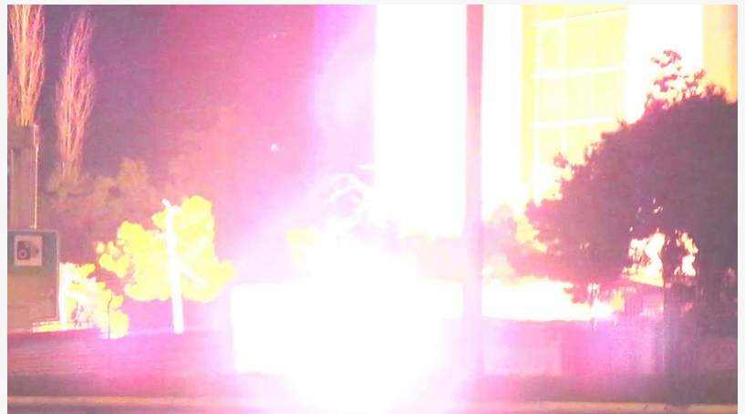
Revolutionary Prosecutor's Office in Tehran's 2nd District-6

This press release can be viewed online at: http://www.einpresswire.com