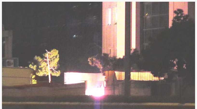
Revolutionary Prosecutor's Office in Tehran's 2nd District-4