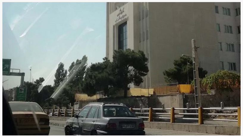
Revolutionary Prosecutor's Office in Tehran's 2nd District-2