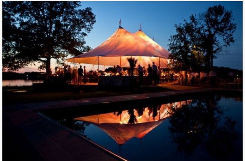
See how this sailcloth tent glows with warm light?

TRENTON, NJ, US, March 9, 2020 /EINPresswire.com/ -- So your planning an event, it could be a wedding, a party, or a festival and you've rented the perfect tent for the occasion. Now you may be wondering how you're going to make that tent wow your guests. You need to decorate it perfectly, and the good news is that there are several options available for decorating your tent . There are two things you need to ask yourself: what decor will go best with the tent you've chosen and what decorations will go with the overall theme of the event.