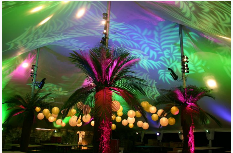
This jungle theme is perfect with the light projections!

This press release can be viewed online at: http://www.einpresswire.com